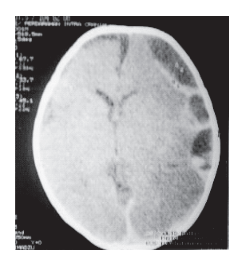
Figure 3. Case 5, CT scan showed chronic epidural hemorrhage on the right fronto-temporoparietal, chronic subarachnoid hemorrhage on the left frontal & right parieto-occipital, left lateralization, cerebral edema.

Intracranial hemorrhage (ICH) in infants is considered to be traumatic and non-accidental causes, like Shaken Baby Syndrome and child abuse, thus