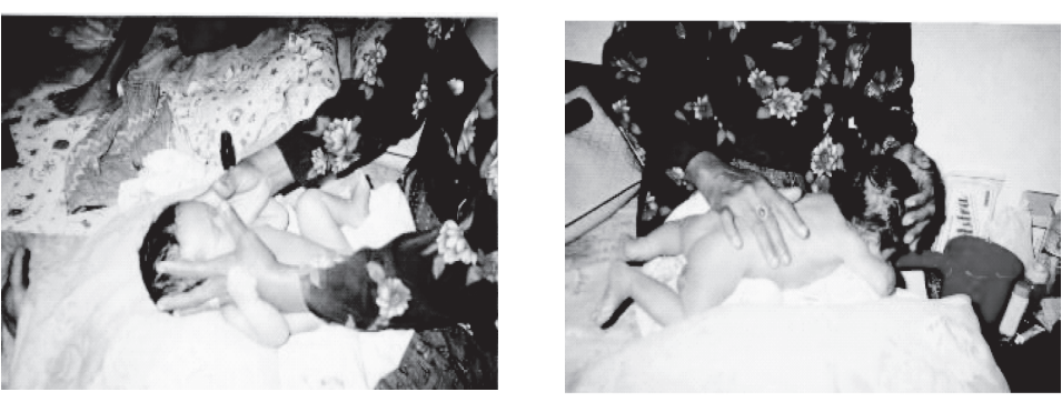
Figure 1. Massaging an infant by a traditional birth attendant