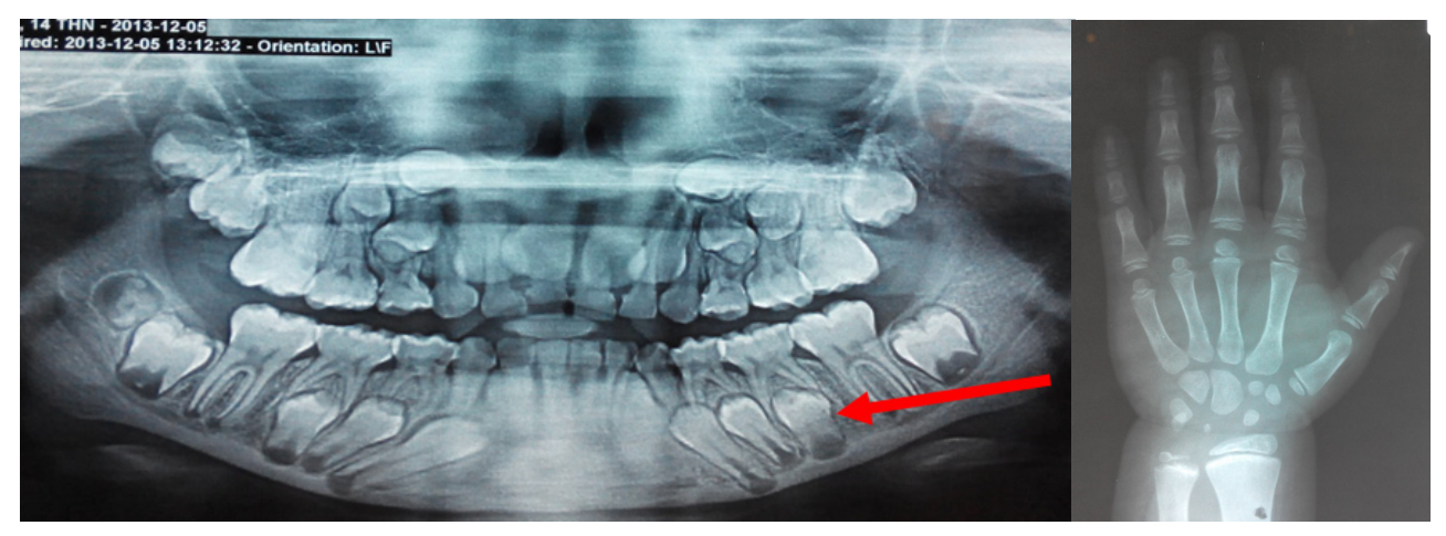
Figure 3. Panoramic and bone age x-rays

Pelvic USG revealed no abnormality in her reproductive organs, as the uterus and both ovaries were normal and without cysts. A panoramic x-ray showed delayed eruption of teeth. Examination of the hand revealed a bone age of 6 year and 10 month girl, with a chronological height of 75.1% of her estimated final height ( Figure 3 ).