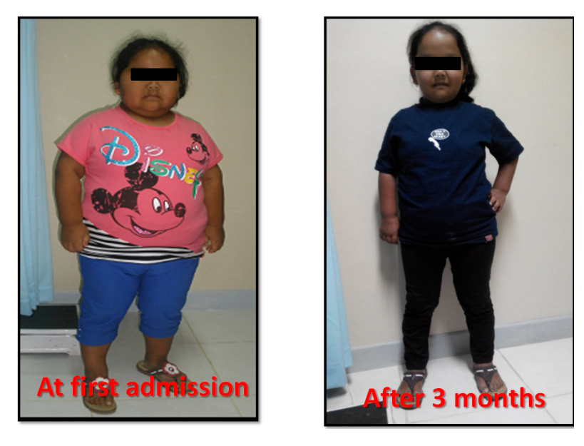
Figure 4. Physical body composition at admission and after 3 months of treatment

On follow up, the patient's condition was improved. Her mother reported that the girl's activity had increased, and she became less disoriented and interested in her surroundings. Her skin became smoother, and she slimmed down. Permanent teeth began to erupt, with the two front teeth already erupted. The black rash patches in her armpits and trunk vanished. Patient defecation became more regular at about once in a day. Patient had just finished her menstrual cycle 5 days prior to the follow-up visit, and reported that it was more normal, with the usual 1-2 times of changing the pad daily, and length of 7 days. The patient was alert and looked more active than before. Her blood pressure had returned to normal. Her body weight decreased 8 kg in one month (from 48 to 40 kg), and to 36 kg after 3 months (Figure 4). Her height increased 2 cm in one month, and 4 cm after 3 months of therapy. Social interaction and physiological well-being also improved, with her PSC score changing to 22 after 1 month of therapy and to 14 after 3 months of therapy. One month after therapy her TSH level decreased (30 mIU/L) and free T4 was normal (1.04 ng/mL). TSH level returned to normal after 3 months of treatment.