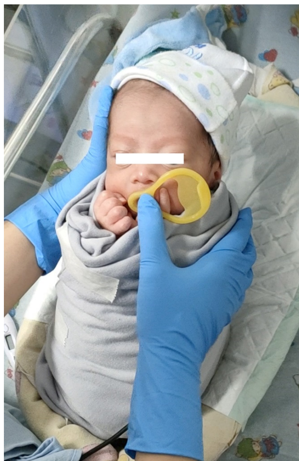
Figure 2. Subjective NNS measurement