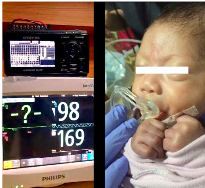
Figure 1. Objective NNS measurement with suction pressure measurement device