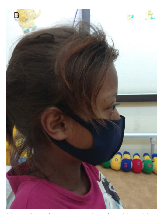
Figure 3 . The improvement in exopthalmos and scleral jaundice after two weeks of antithyroid treatment [3A=frontal view; 3B=side view]

Cholestasis in children can be caused by several etiologies such as infection, drug effects, genetics, immunology, metabolic problems, and malignancy. Our patient had no signs of infection such as fever and her laboratory test results showed no increase in white blood cells count. Liver infection and inflammation can be caused by parasites, including malaria and hepatotropic viruses such as Epstein-Barr virus, as well as hepatitis A, B, and C. HBsAg tests were performed to rule out hepatitis B infection, but hepatitis A and C examinations were not performed. Generally, cholestasis caused by viral infection of the liver appears in chronic cases and lasts 4-30 days, whereas in acute cases cholestasis symptoms improve within 2 weeks of treatment. A malaria examination was also performed with a negative result, since Southwest Sumba district is an endemic area.<sup>6</sup>