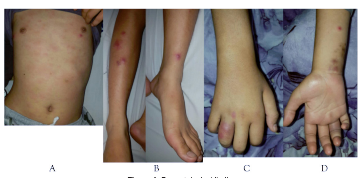
Figure 1. Dermatological findings

(A) multiple erythematous rash on the chest, (B) multiple erythematous nodules on the right and left lower limbs, (C) edematous right ring finger with large pustule, (D) right arm with multiple erythematous lesions on the flexor side.