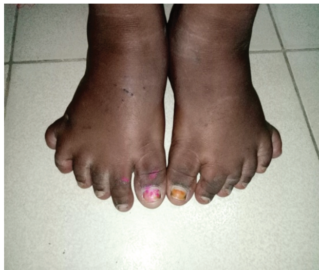
Figure 2. Polydactyly