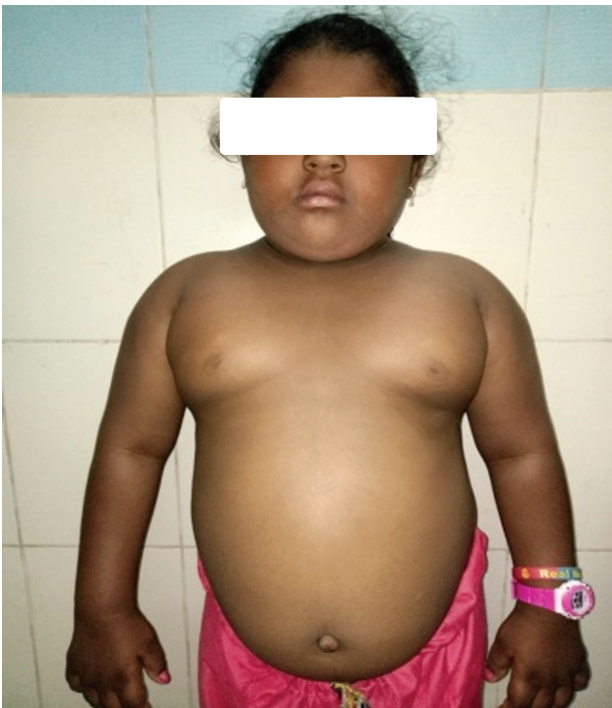
Figure 1. A 7 year-old case patient

Laboratory investigations including complete blood count (CBC), random blood sugar (RBS), alanine transaminase (ALT/SGPT), serum creatinin, lipid profile, free thyroxine (FT4), thyroid stimulating hormone (TSH), follicle stimulating hormone (FSH), luteinizing hormone (LH), urine routine and microscopic examination (RME) revealed normal findings. No abnormalities were seen on chest x-ray, electrocardiogram (EKG) or echocardiogram. Hepatomegaly with fatty changes in liver was detected