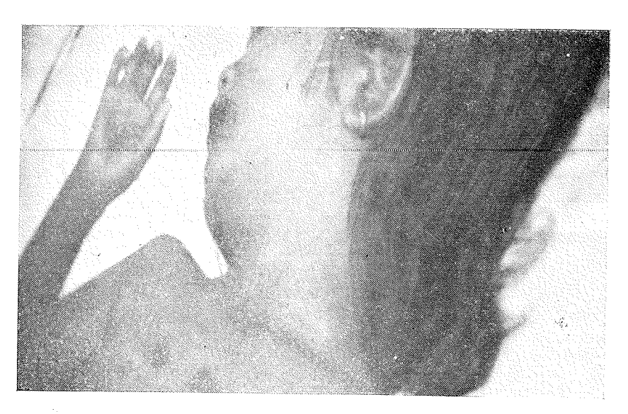
FIG. 2. Swelling of the Cervical lymphnodes