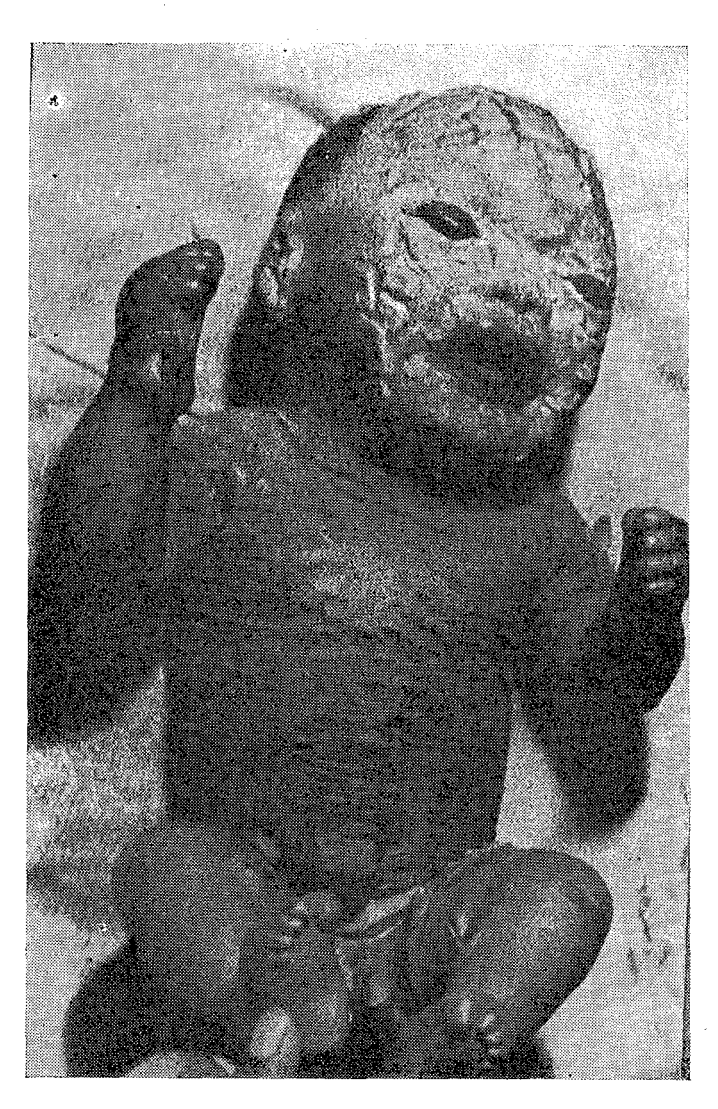
FIG. 1: Harlequin foetus. Multiple fissures are separated by thick scales. There is eversion of the lids and the fishmouth appearance of the lips is characteristic.