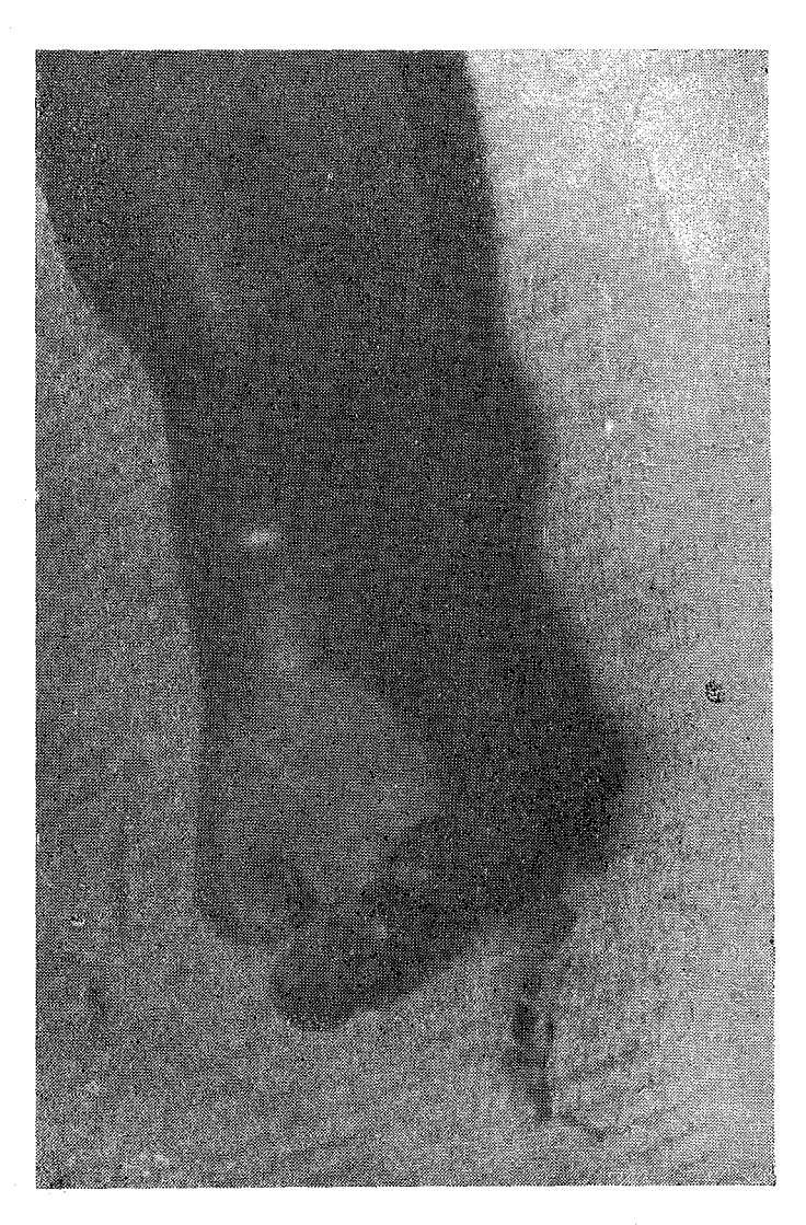
FIG. 3: Claw-like hand of the same patient.