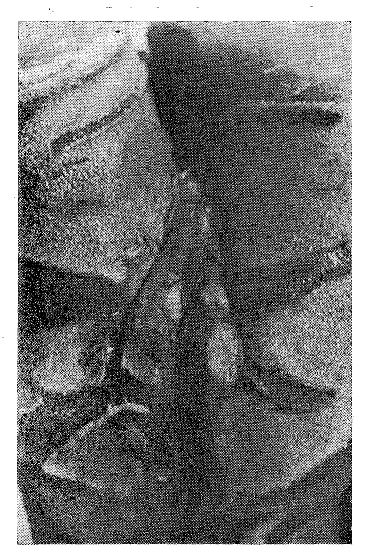
FIG. 2: The same patient from another view.