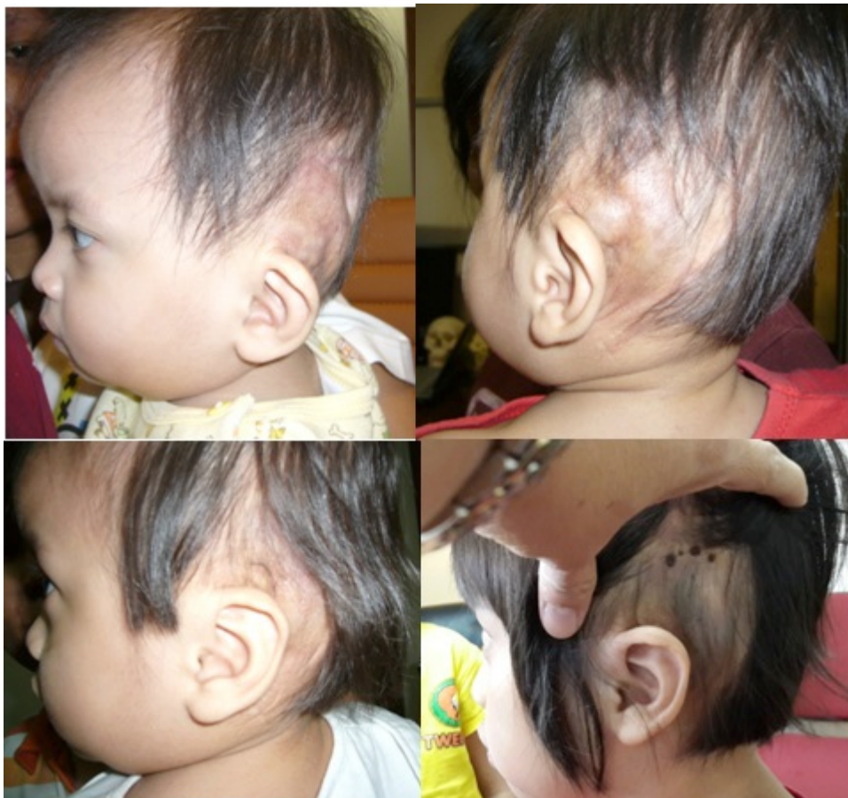
Figure 4. Upper left: 1 month after surgery. Upper right: 6 months after surgery. Lower left: 1 year after surgery. Lower right: 3 years after surgery (age 4 years, height 92.5 cm).